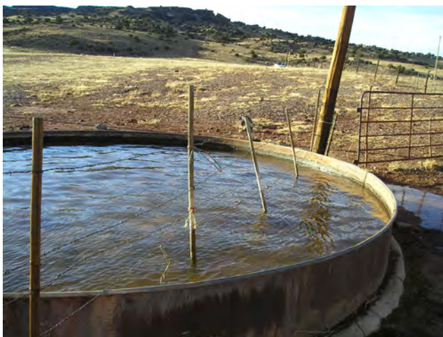
Figure 1 Round trough fenced off between pastures causes interference