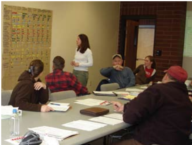
Figure 4 LWG participants discuss local plan development