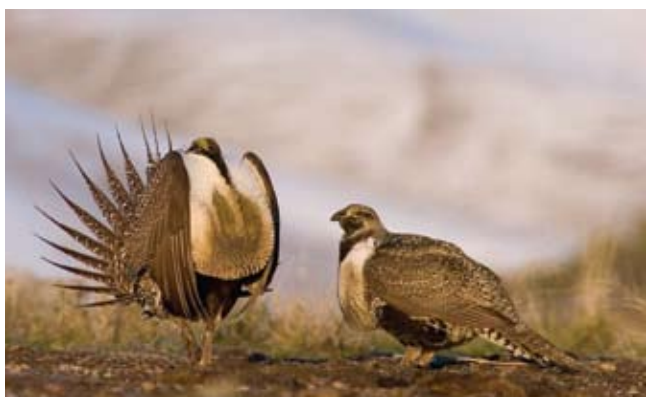
Figure 3 Sage-grouse on lek