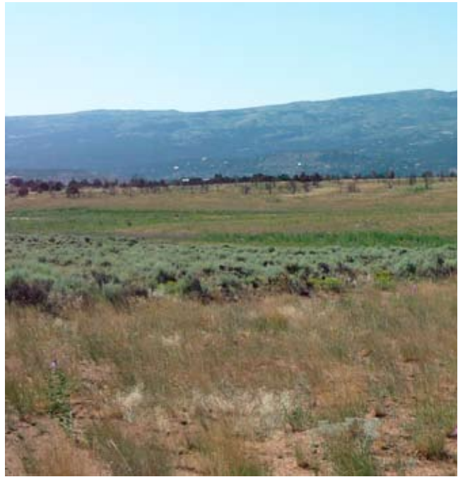
Figure 6 Wildfire rehabilitation site in sage-grouse habitat