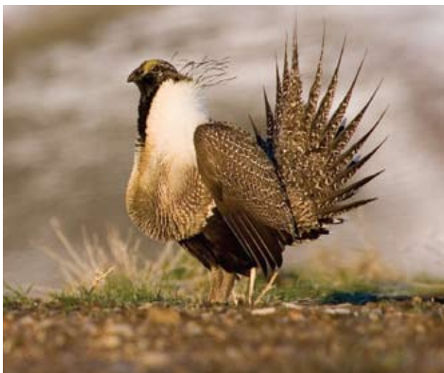
Figure 1 Male sage-grouse

Many NRCS employees already participate in sage-grouse local working groups. However, recent research suggests that these groups will need more assistance to achieve their full potential. With the support of a USDA NRCS Fish and Wildlife Conservation Grant, researchers from Utah State University conducted a comprehensive needs assessment and evaluation of the LWGs across the sage-grouse range. In 2007, more than 700 working group participants returned a mail survey that asked respondents about LWG effectiveness, needs, and challenges. In 2008, researchers interviewed key members of four LWGs to gain a greater understanding of their groups and the role NRCS has played—or could play—in them. The information presented in here is based on this research. This document is designed to provide NRCS staff with guidance on how to best assist LWGs achieve their full potential.