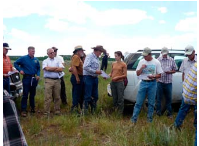
Figure 5 LWG field tours visit habitat manipulation sites