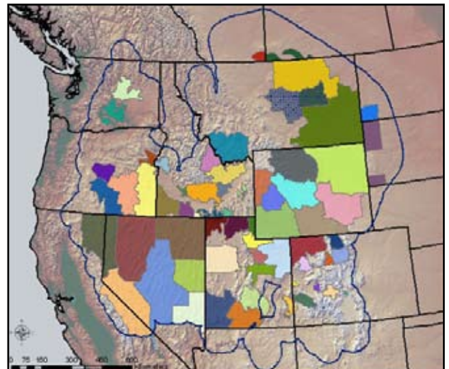
Figure 2 Sage-grouse local working group boundaries, 2008