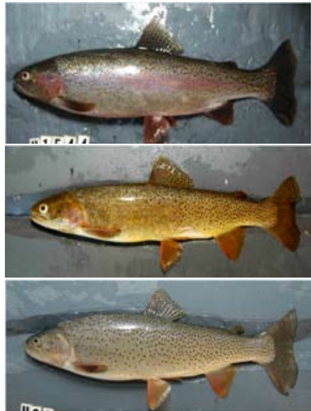
Steven M. Seiler

The rainbow trout (top) readily hybridizes with cutthroat trout, such as the yellowstone cutthroat (middle). The resulting hybrid coloration (bottom) is highly variable.