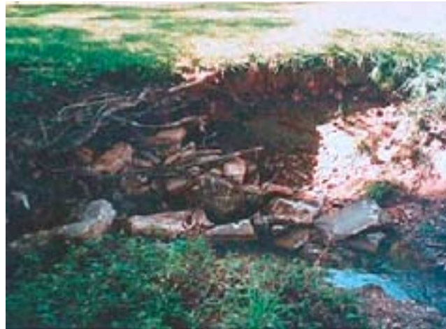
Virginia Department of Forestry

Landowners wishing to improve freshwater habitat should first evaluate the existing conditions. A quick visual assessment will often yield clues about the general health of a stream reach. A simple evaluation of canopy cover in the riparian area, bank stability, water clarity, and other easily recognizable features often suggest actions that can be taken to improve stream and riparian habitat.