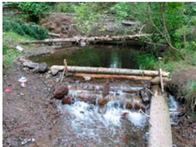
Washington Department of Fish and Wildlife

Permanent (above) and temporary (below) fishways allow for the passage of migrating trout. Dams and culverts significantly reduce the amount of connected habitat available for use by cutthroat and other trout species.