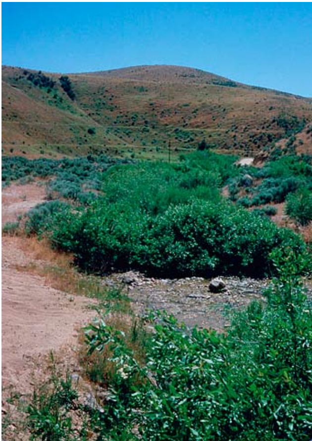
U.S. Fish & Wildlife Service

The most important factors limiting sharptail populations are the loss of open landscape caused by fire suppression, succession, and tree planting. Other pressures on population include predation, hunting, and disease, though these factors are minor compared to the overall loss of habitat.