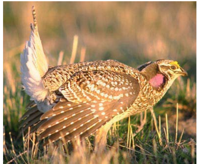
Royal Alberta Museum

The purpose of this leaflet is to provide information that will enable landowners and land managers to recognize opportunities to improve habitat for sharp-tailed grouse and assist with the development and implementation of effective management plans for the species. The success of any wildlife management action requires a clear statement of management goals, an awareness of the habitat requirements of the target species or wildlife group, accurate means to assess habitat conditions, effective tools and adequate resources to address habitat limitations, and follow-up monitoring of wildlife responses. The leaflet also iden-