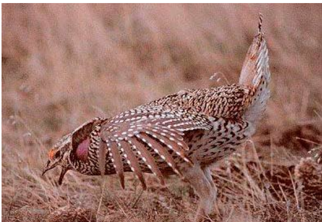
Washington Department of Fish and Wildlife

Sharp-tailed grouse feed mainly on the ground during spring, summer, and fall, occasionally foraging in the treetops. When snow is deep during winter, they may forage in shrubs and trees. During severe winters,