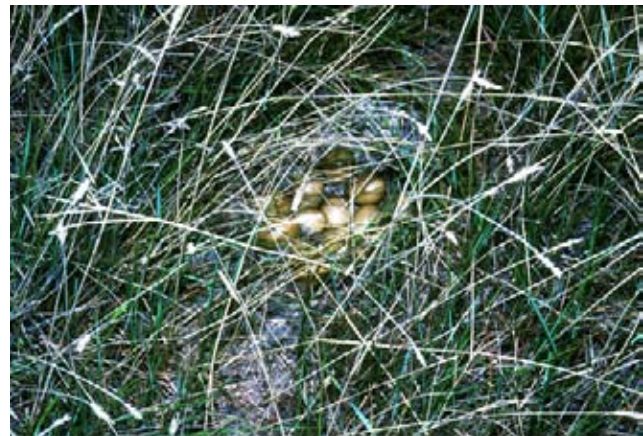
R.J. Peck, Environmental Canada

Male sharp-tailed grouse performing courtship display