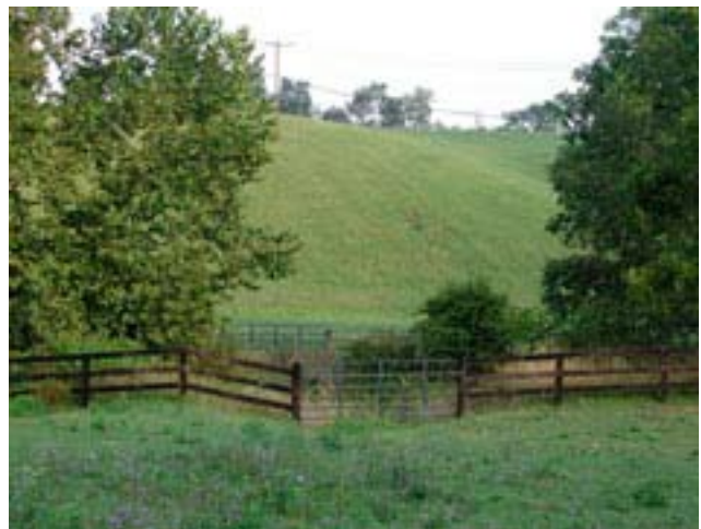
Livestock should be fenced out of stands of deciduous trees and shrubs in riparian areas.

In forested areas, clearcut logging on a landscape level can be beneficial to sharptail populations. Logging creates excellent, though temporary, nesting and escape cover for sharptails. However, logged sites are sometimes re-seeded with conifers, which are detrimental to sharptail habitat.