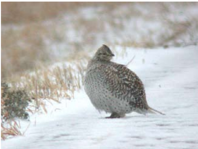
U.S. Fish & Wildlife Service

Landowners can assess the availability of suitable sharp-tailed grouse habitat on their property. Table 3 is an example of an inventory chart for assessing sharptail habitat. For planning purposes, rate the habitat components for the designated planning area