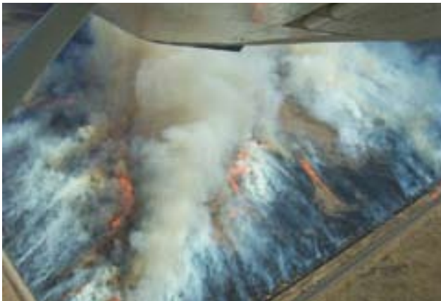
Bill Berg, Minnesota Sharp-tailed Grouse Society

Sagebrush ( Artemisia spp.) can provide food for sharp-tailed grouse year-round.