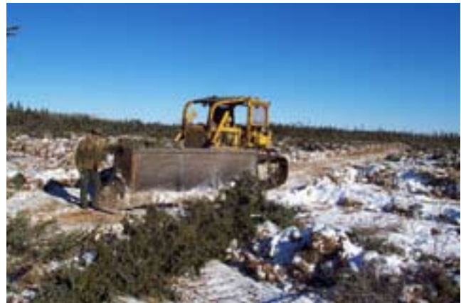
Bill Berg, Minnesota Sharp-tailed Grouse Society

A major problem in maintaining sharptail habitat is advancing vegetation succession. Over time, brush and tree canopy cover increase and begin to close in on the open grass-brush landscape that sharptails require.