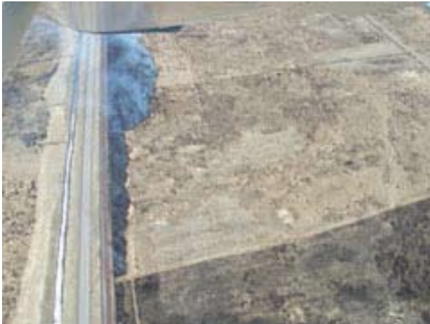
Bill Berg, Minnesota Sharp-tailed Grouse Society

As with prescribed burning, the effects of manipulating vegetation in sharptail habitats vary with the type of vegetation present. In grassland habitats, vegetative manipulation should be minimal, as it reduces nesting and brood-rearing habitat. In habitats that are dominated by deciduous shrubs and/or trees, some vegetative manipulation may be beneficial to create a more open grass-brush landscape.