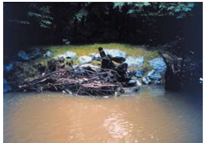
Figure TS14E-13 Debris lodged against rootwads

This factor is figured by estimating the percentage of voids in the surface area that are not anticipated to plug/fill with debris. Use conservative judgments when making this estimate. If method 1 is used to calculate the surface area, the permeability coefficient (K) is 1.0.