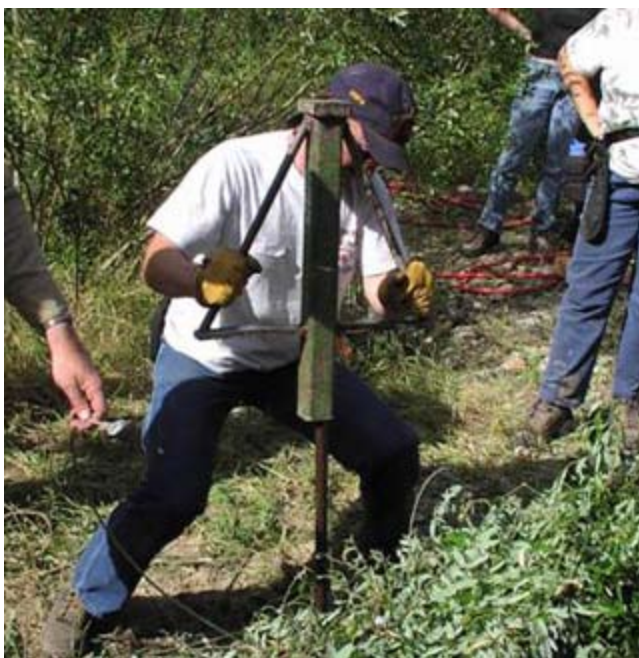
Figure TS14E-3 Post driver being used to install soil anchors