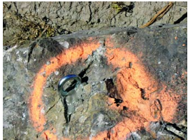
Figure TS14E-10 Wire rope anchored in boulder with epoxy