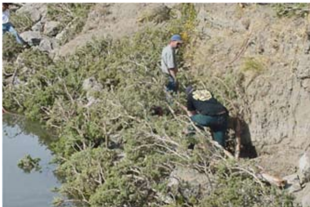
Figure TS14E-8 Boulders serve dual purpose: to stabilize the toe and secure brush revetment