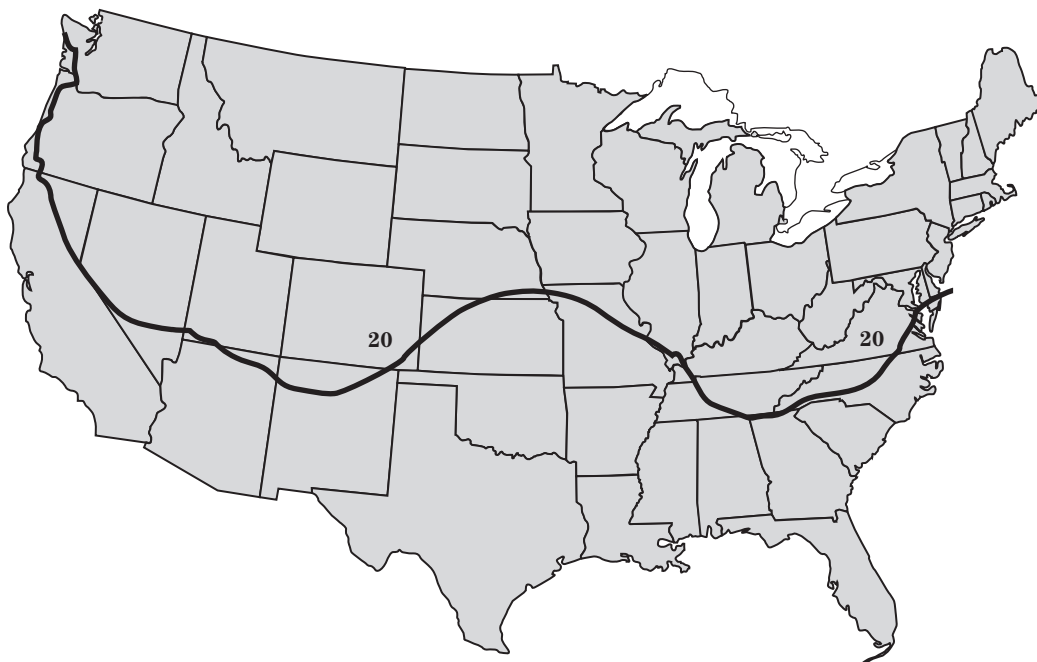
Figure 523–1 Number 20 freeze-thaw severity index isoline (map approximates the map in ASTM D5312)