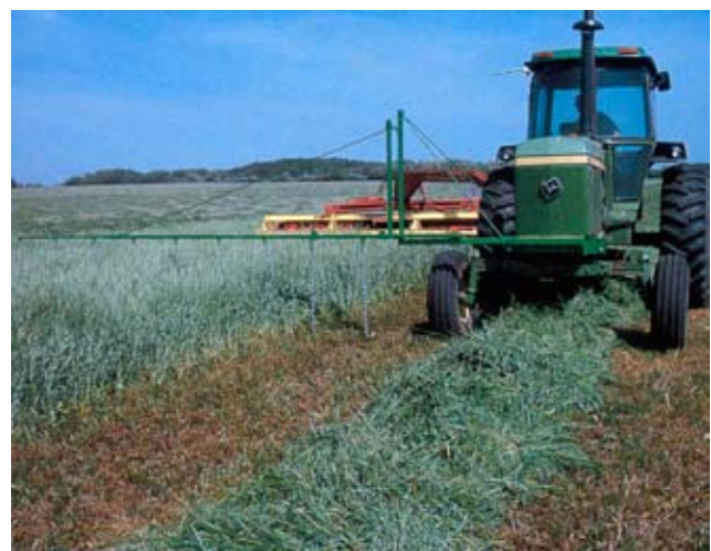
Ducks Unlimited, Canada

Early successional habitat is very important for the survival of many species. Due to the abandonment of farms and suppression of natural disturbances, much of the historical early successional land in the United States has grown into mid- and late-successional forests. There are many methods to manage for early successional habitat including cutting, windrows, disking, mowing, prescribed grazing, prescribed burns, herbicide use, and field border management. When these techniques are applied, areas can be brought back to an early successional state to the benefit of many species.