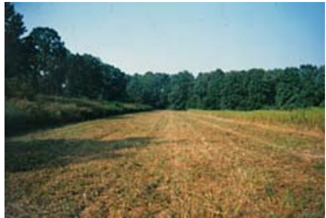
Virginia Department of Game and Fisheries

To create and manage a field border, 50 feet of untilled field along any edge adjacent to woody growth should be cut. Every 3 years, this border should be mowed and lightly disked to prevent invasion by saplings and brush. Another option is to treat a third of the border each year, rotating strips every 3 years.