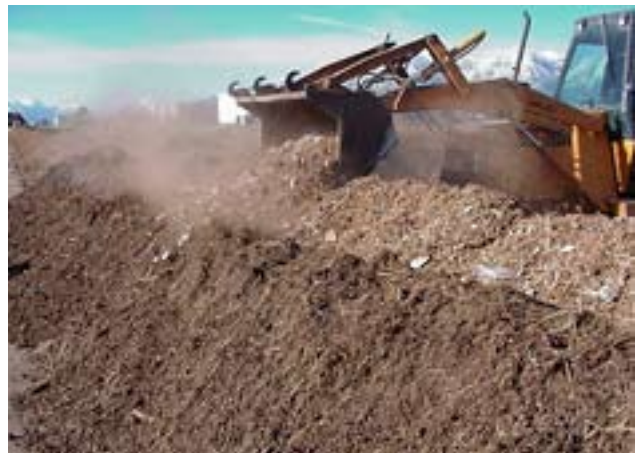
Nevada Division of Environmental Defense

Careful clearcutting can produce valuable early successional habitat.